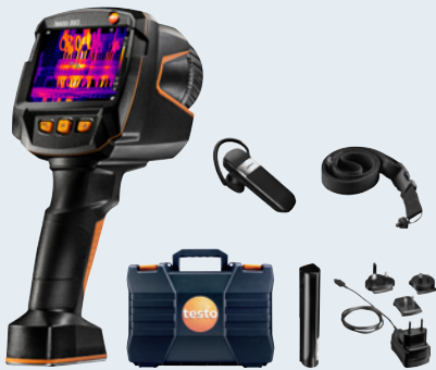
Order no. 0560 8830