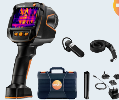
Order no. 0563 8830